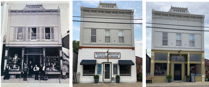
The Nauvoo Christian Visitor Center's building façade has been restored to its original 1882 style. The fresh new look fits right in!

The Nauvoo Chamber of Commerce offered an opportunity to learn more about the many businesses and their beneficial services in Nauvoo. Current membership includes 69 businesses. Twenty-five local merchants highlighted their wares. There were approximately 150 local and area residents in attendance. The Nauvoo Chamber of Commerce activities range from hosting events (such as this one), sponsoring and supporting charitable works ($145 was raised in donations to go toward Nauvoo's share of the cost of this year's Independence Day fireworks). Visit BeautifulNauvoo.com website and Facebook pages for additional activities.