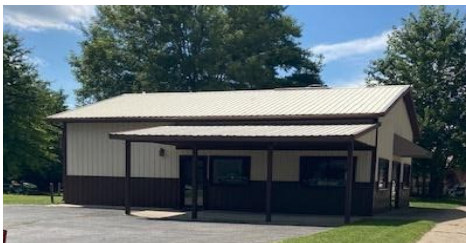
Former Cornerstone of Zion Has New Owners

Four Mulholland business locations were highlighted in the October 2021 issues of See Nauvoo News . Since then, the former Mill and Bakery (now the Nauvoo Café and Sweet Shoppe) and the former Cornerstone of Zion (usage to be determined) have been purchased. The former Kraus Furniture Store was recently given to the Knights of Columbus, who plan to expand their food offerings to the public (fish fry events, among other activities) The theater at the rear of Grandpa John's is getting some remodeling in hopes to offer a venue for performances. Now, if we can find new owners for the former Sinclair Station and the former real estate office, (pictured) we'd all be delighted. They are in prime business locations on corner lots across the street from each other.