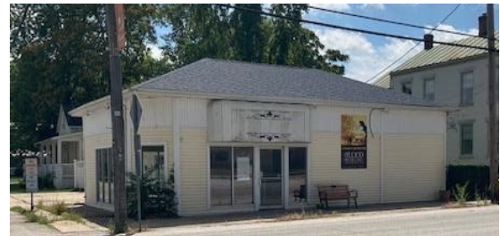
Former Blimpie's/Real Estate Office