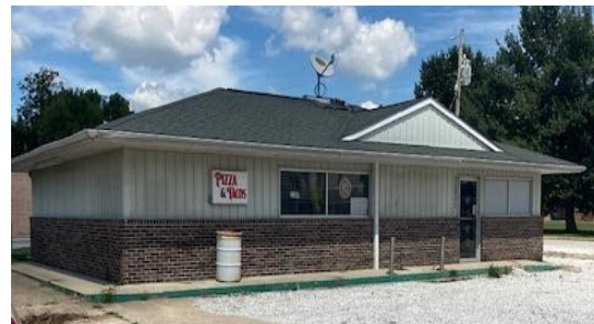
Former Sinclair Station