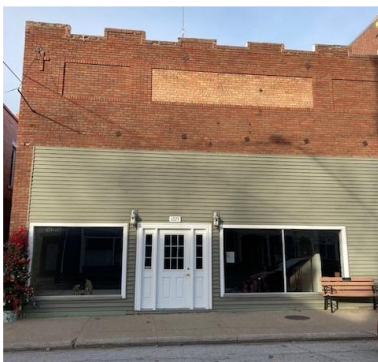
Knights of Columbus Now Owners of Former Kraus Furniture store