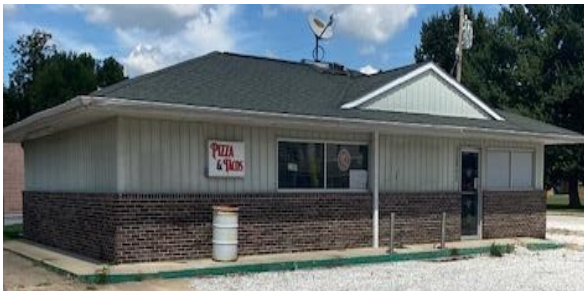
The former Sinclair Station, Mulholland & Barnett