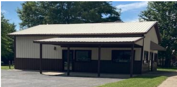
The former Cornerstone of Zion, Mulholland & Robinson