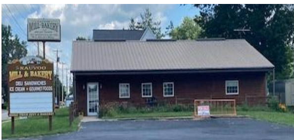
The former Mill and Bakery, Robinson & Mulholland