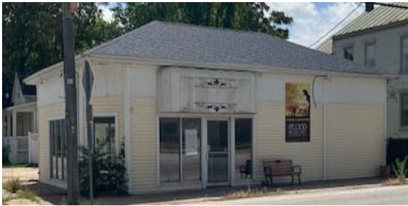
The former real estate office, Mulholland & Barnett

The real estate business has been brisk in Nauvoo. Besides houses and land being purchased, commercial buildings are looking more attractive to buyers, and former businesses are reopening with new owners. Pictured are four buildings - all on corners - in the Commercial District that have possibilities and are looking for new owners. Maybe that person is you!