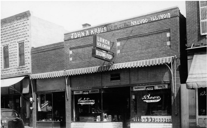
c. 1920’s Kraus Café and Confectionary