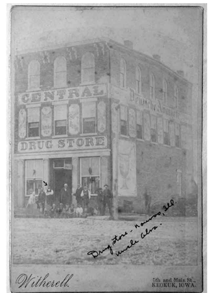
5th and Main St., KEOKUK, IOWA.